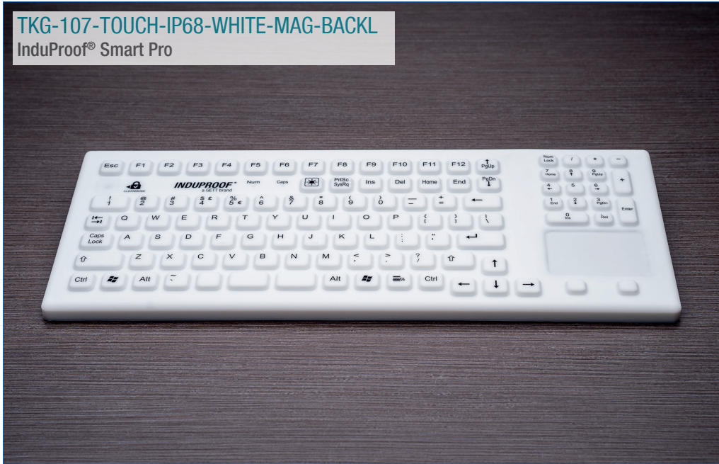
TKG-107-TOUCH-IP68-WHITE-MAG-BACKL InduProof® Smart Pro